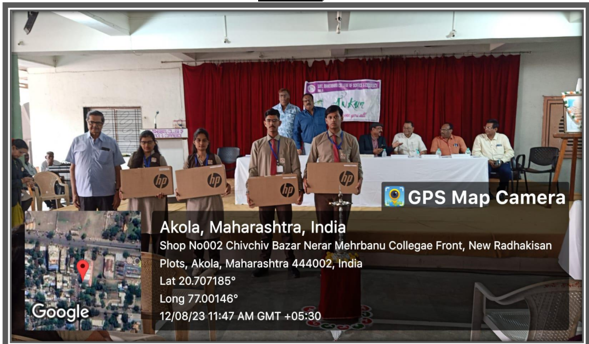
Distributing laptops to students is a proactive and effective approach to enhance their learning experience by providing hands-on technical skills and practical know-how.