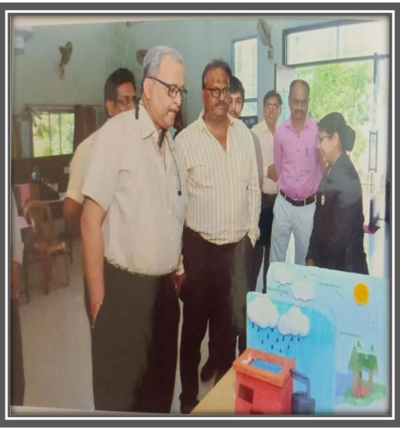
Model Presentation by Partaker