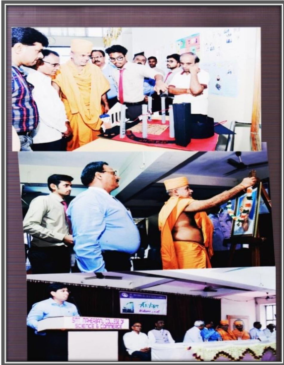
Inaugral of Induction Program 'ANKUR' and Poster and Model Presentation in the presence of Intellectual Judges and Dignitaries.