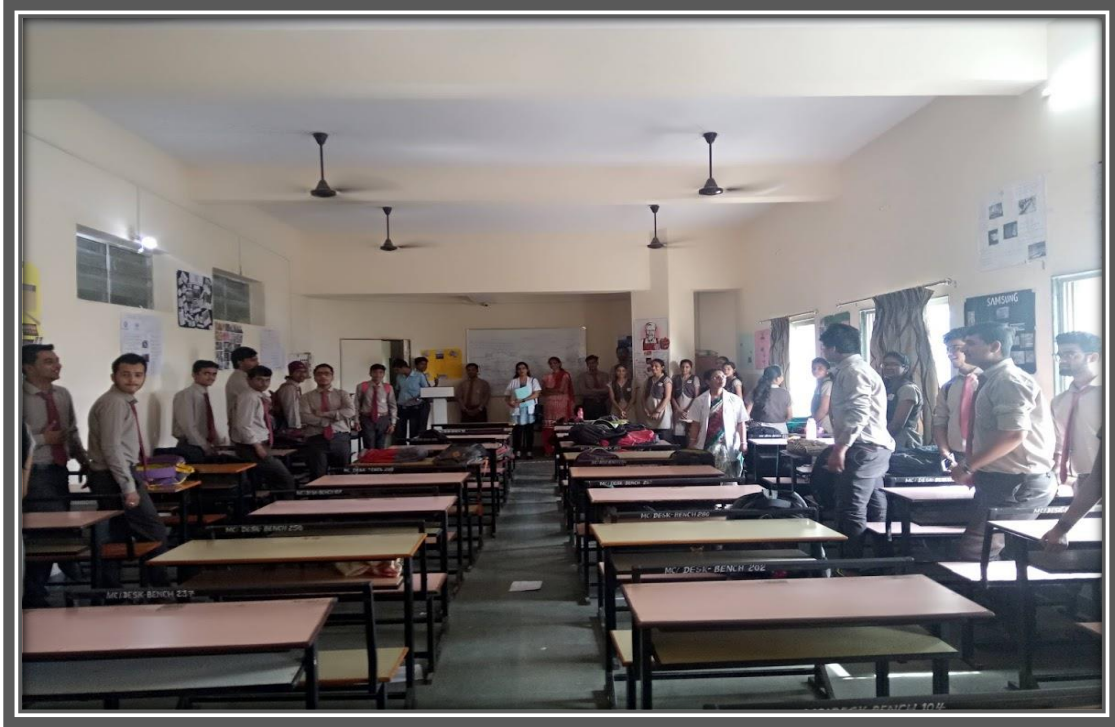
Poster Presentation on topic 'Entrepreneurship and Start-up'