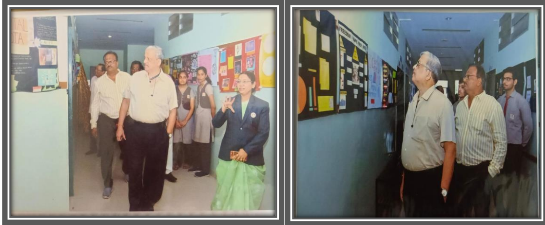
Dignitaries Judging Poster Presentation by Partaker